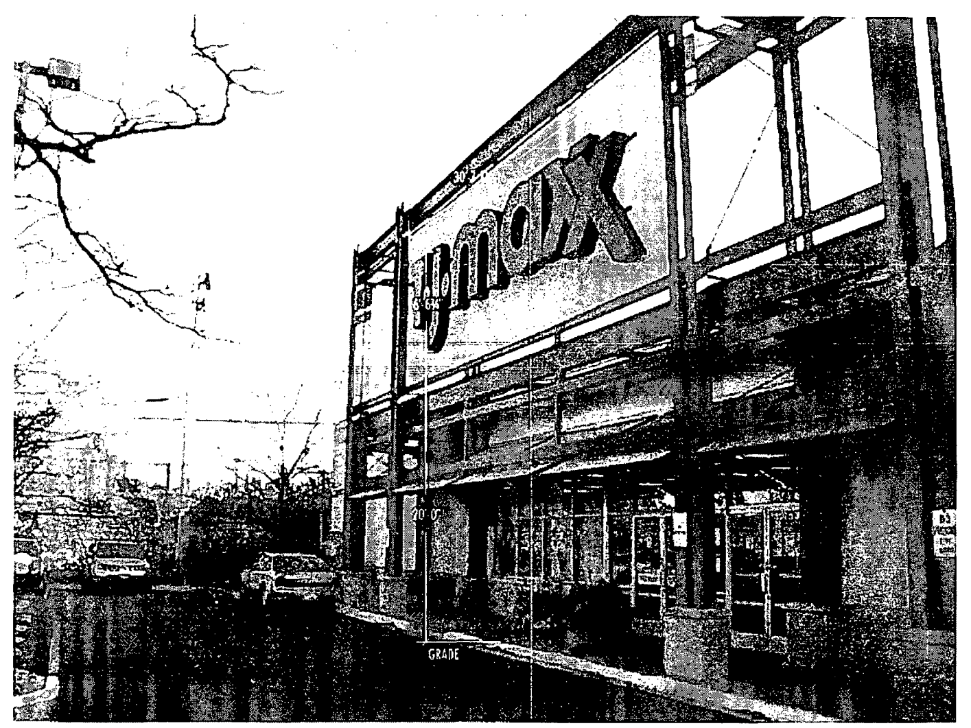
NORTH BUILDING ELEVATION SCALE: 3/16' = 1'-0"