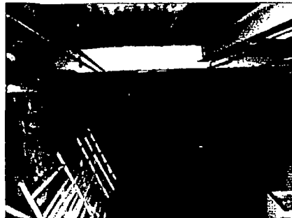
② Sidewalk Vault Image SCALE: N.T.S.