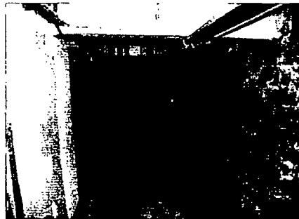
① Sidewalk Vault Image SCALE: N.T.S.