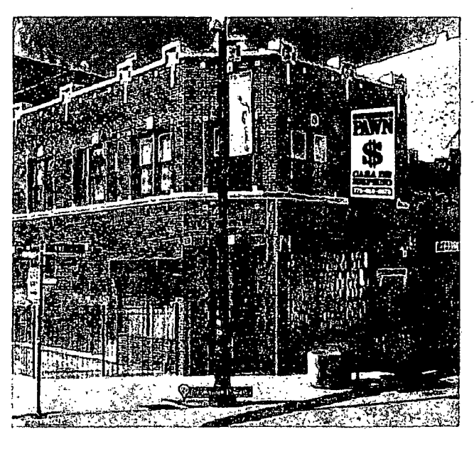
SHOWN ON BLDG