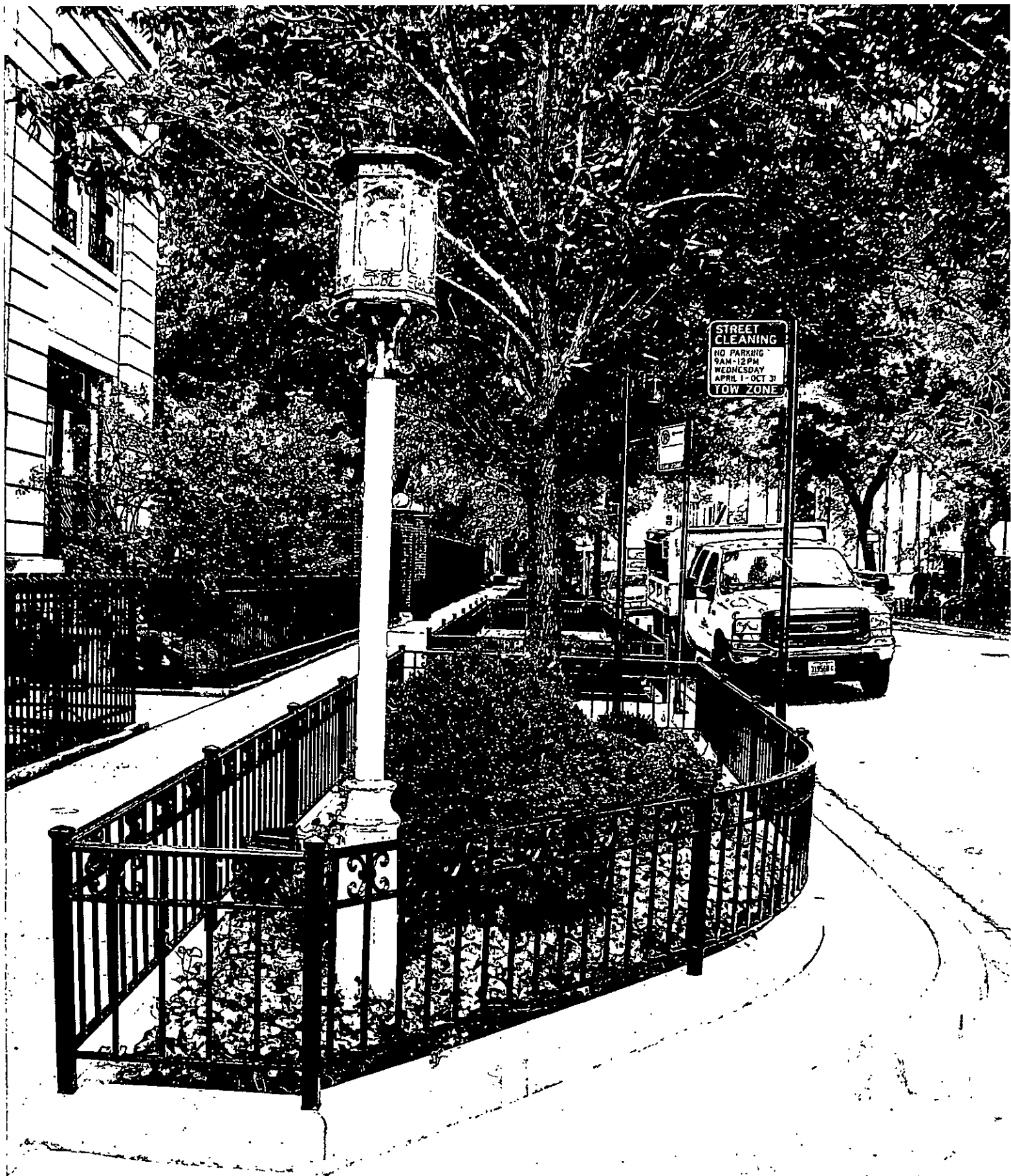
65.E. GOETHE, 60610 (WEST OF ENTRANCE)