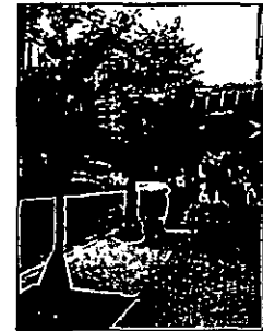
VIEW OF PUBLIC RIGHT OF WAY ALONG RUSH STREET