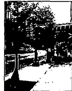
VIEW OF PUBLIC RIGHT OF WAY ALONG RUSH STREET