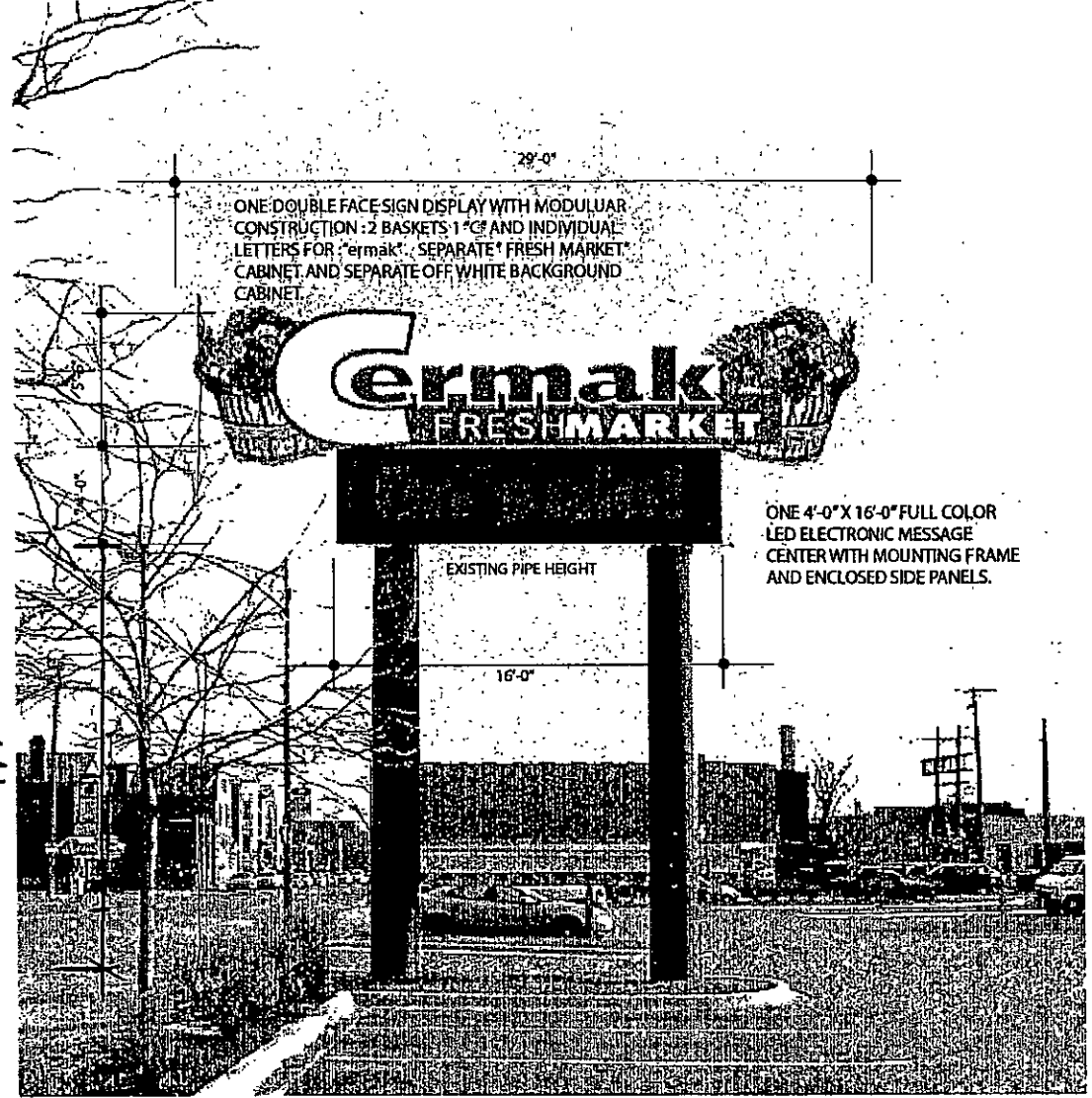
WEST ELEVATION SCALE 1/8" = 1'-0"