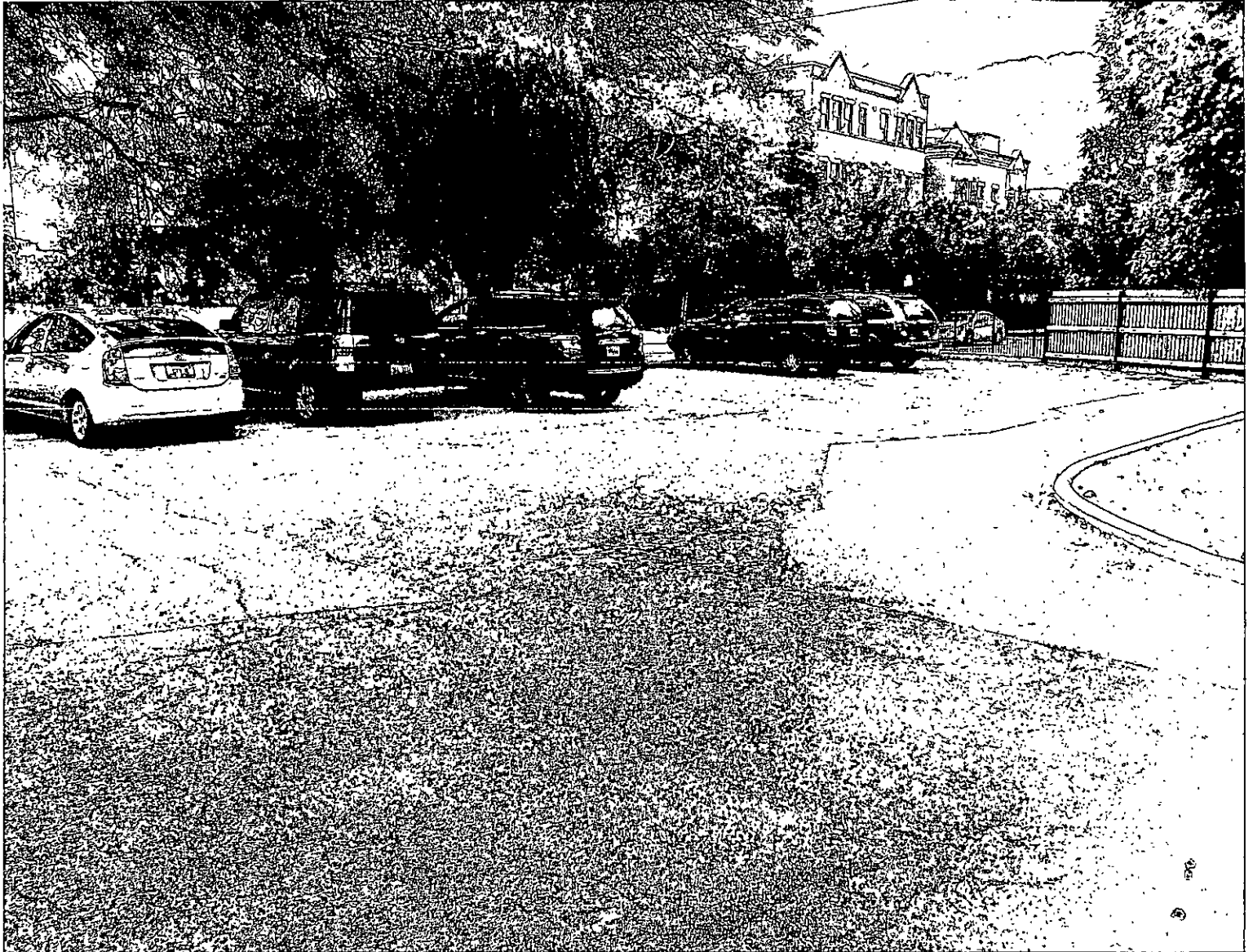
PARKING SPACES LOCATED IN THE AREA OF THE W. EVERETT AVE VACATION/CLOSURE.