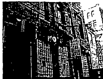
③ Vent Ducts & A/C Unit SCALE: N.T.S.