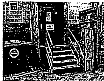
④ Exit Stairs SCALE: N.T.S.