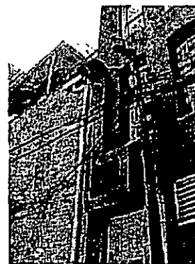
⑤ Vent Ducts SCALE: N.T.S.