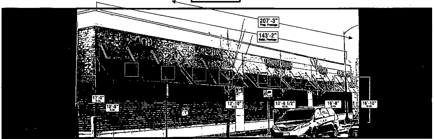
Existing Signage - East Elevation DAMEN AVE. SIGNS: 6