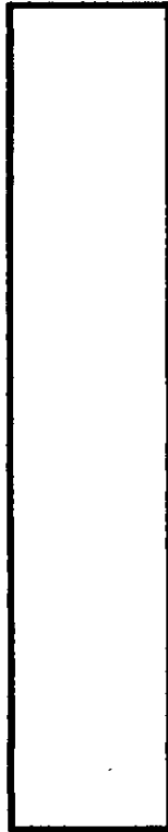
Depth of Structure 12"