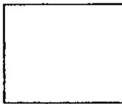
12' Total depth over public way