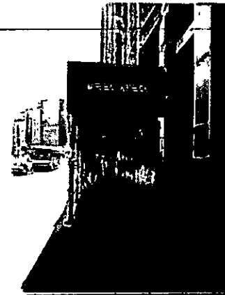
CANOPY END CAPS (WACKER AND CLARK)