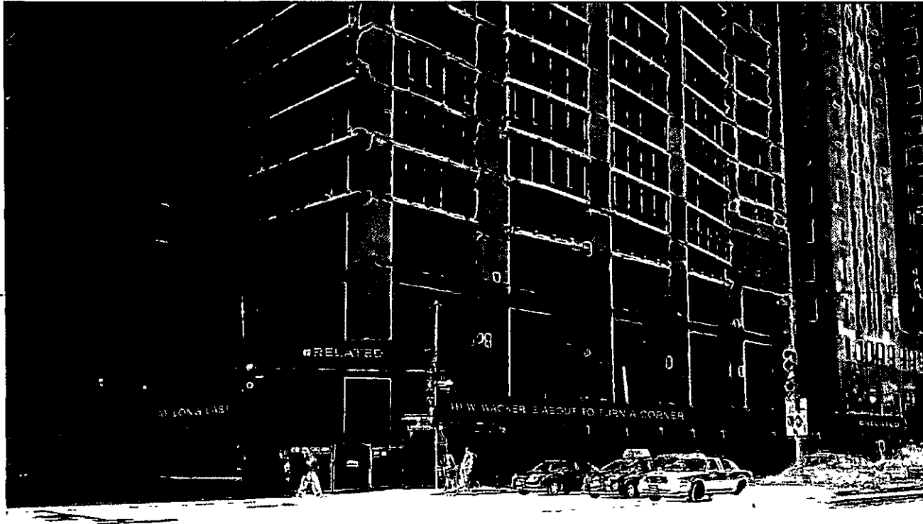
CORNER OF WACKER AND CLARK