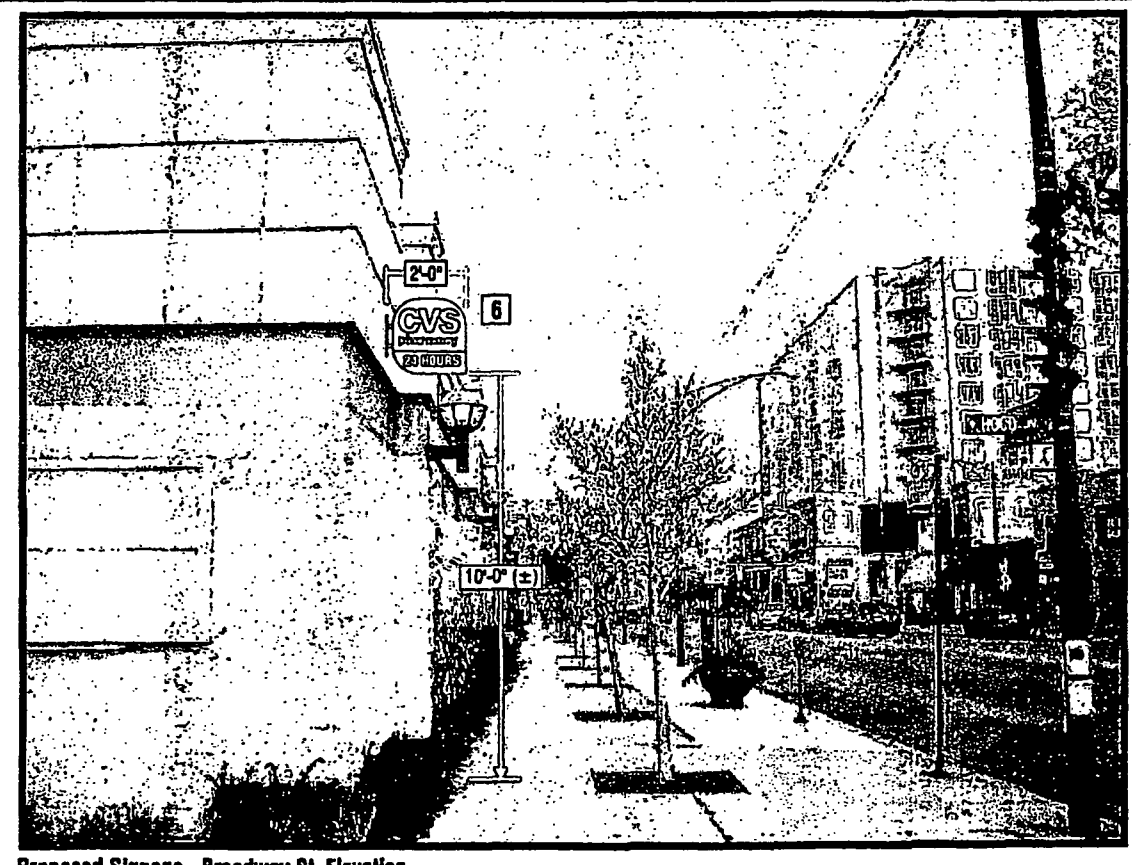
Proposed Signage - Broadway St. Elevation