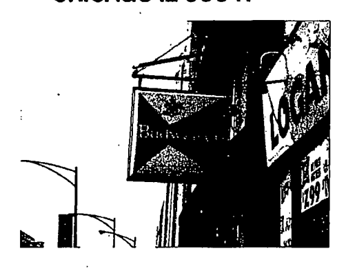
LOGAN LIQUORS 2639 N. KEDZIE CHICAGO IL 60647