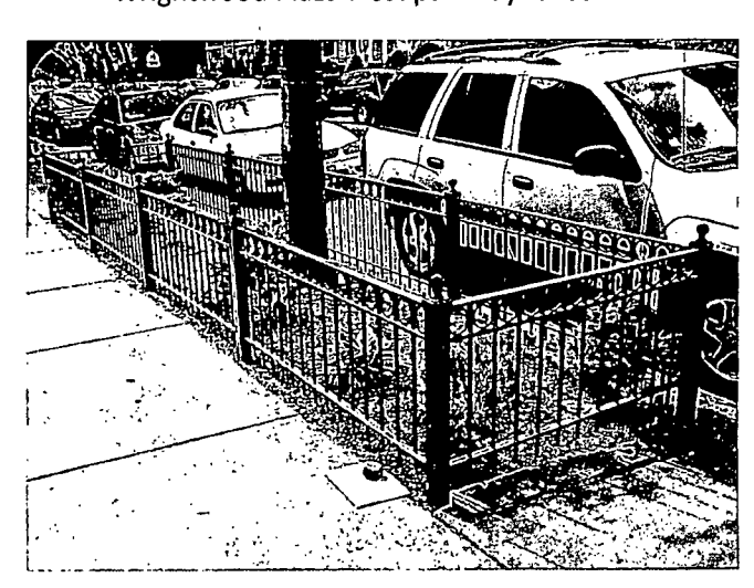
Wrightwood Plaza west parkway fence