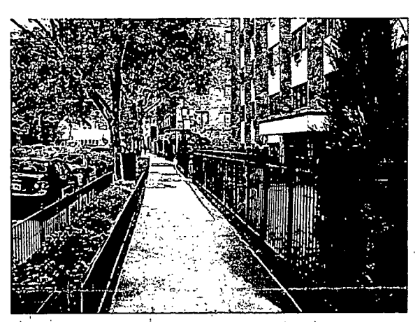
Sidewalk looking east to Clark street