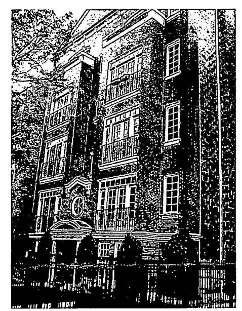
Wrightwood Plaza parkway pictures Front of the building