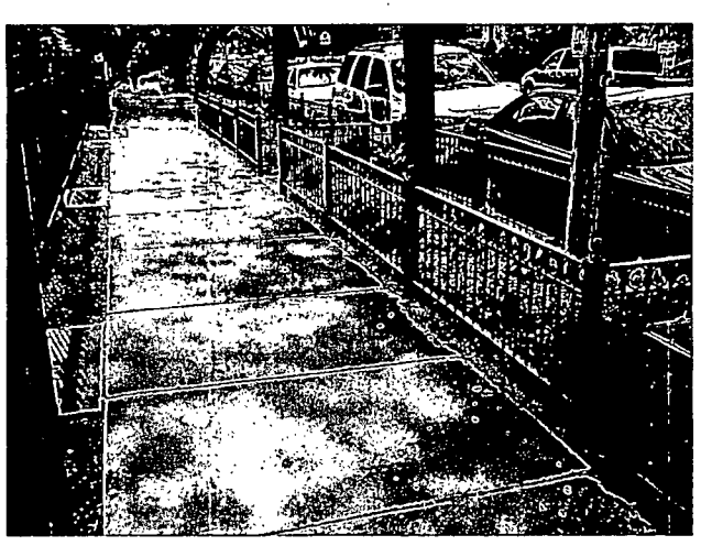
Wrightwood Plaza parkway fences