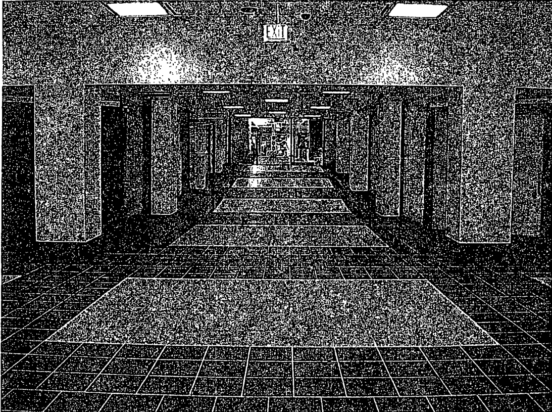
Tunnel looking North toward Macy's