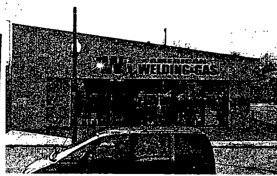
Led Sign + Plastics all the signs I will connect to timers LED Board is programmable thru a remote control wireless Permit & Installation two LED Boars and two plastics $7250