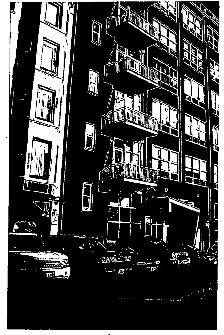
W. GLADYS AVE ELEVATION