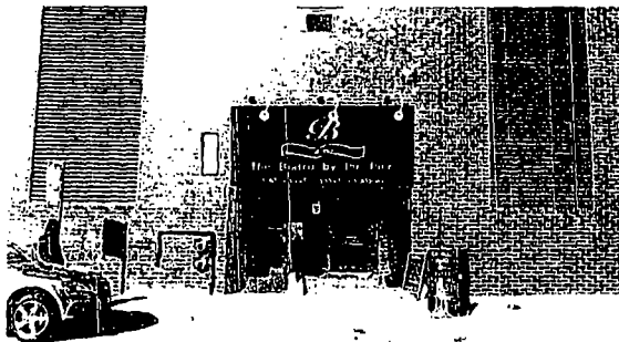
LOCATION OF SIGN ON BUILDING, AND LOCATION OF AWNING ABOVE DOOR