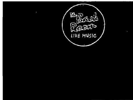
NIGHT VIEW - NTS

Designed 110 Volts Electrical Connection will be Visible within 8 Ft. at time of installation. Second Trip will be Charged at Time & Material