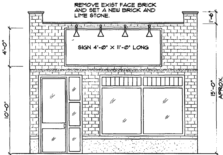
NORTH ELEVATION SCALE: 1/4" = 1'-0"