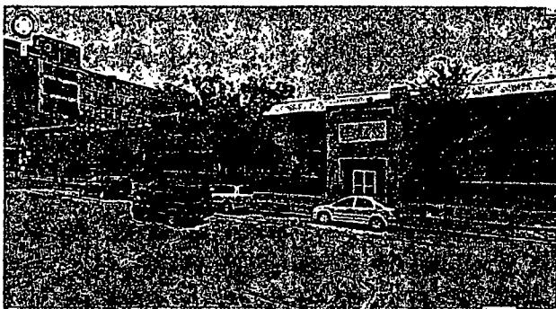
full view of building