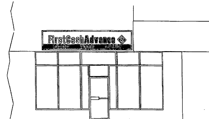
3'x 14' SINGLE FACE SIGN PROJECTING 8" OVER R.O.W.