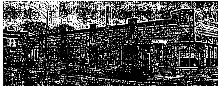
WEST ELEVATION - Perspective View - with Proposed Sign In Place. N.T.S.

Custom size of 0'-9" (H) X 14' - 9 1/8" (L) to cover over existing recessed pocket on fascia, painted Benjamin Moore HC-45 Shaker Beige (to match fascia).