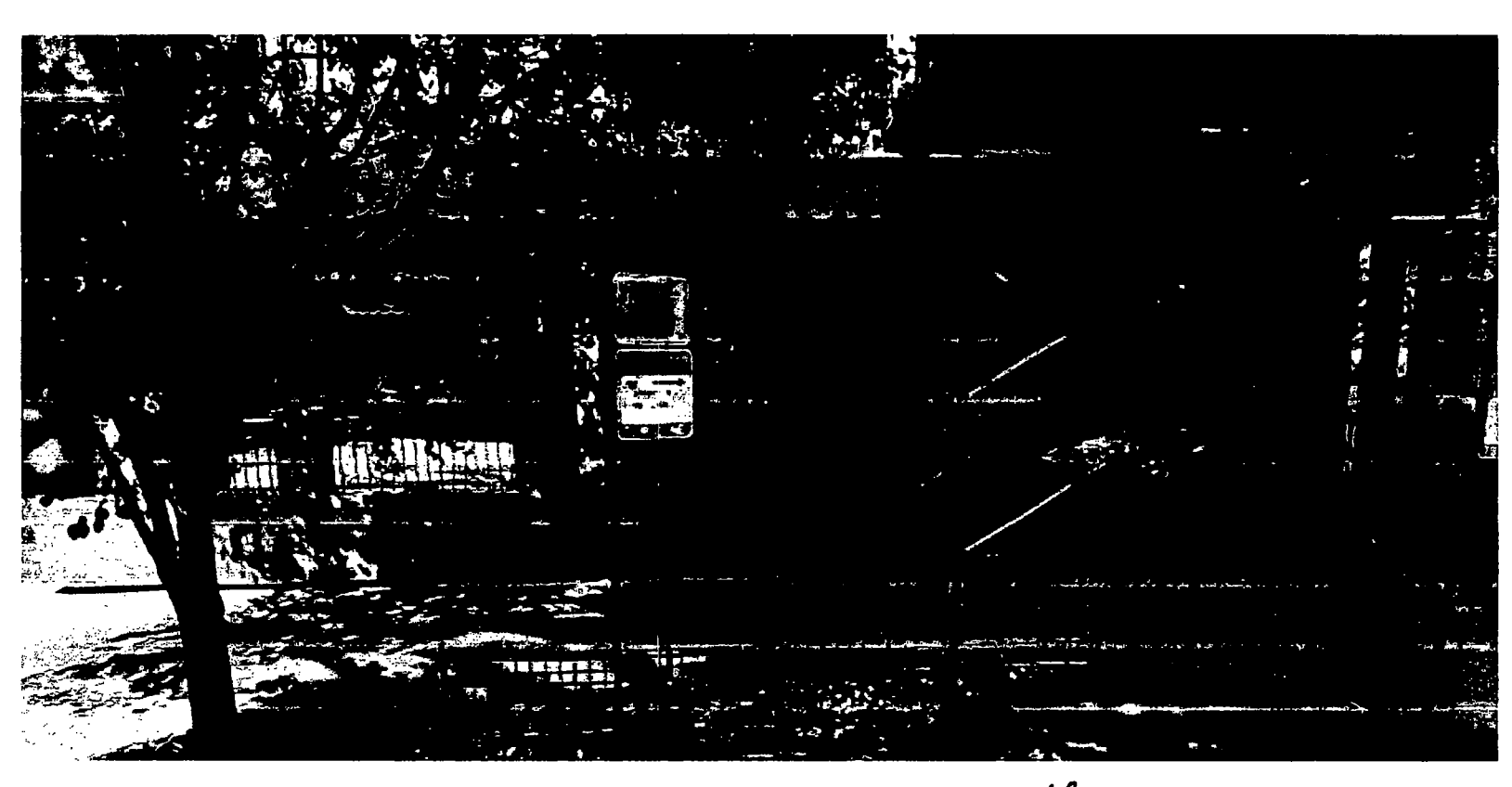
Existing Stope Wall Struct 270 Evaluation P.W.U. 1110200