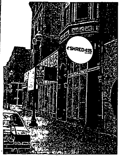
OPTION 2 / WHITE

REFACE (1) 4' 6" (DIA.) EXISTING D/F NON-ILLUMINATED COIN SIGN 02-10-14 / OPTIONS