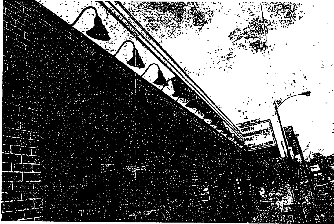
North Community Bank 1600 W. Chicago Ave. 15 gooseNeck lights