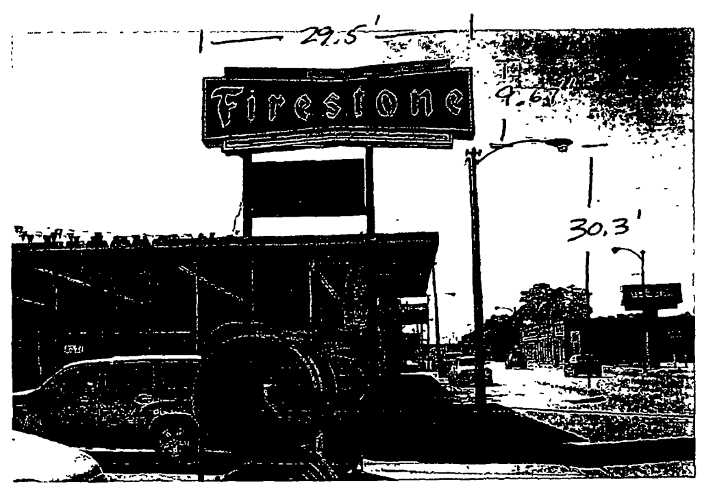
MEAREST CROSS ST IS MENARD