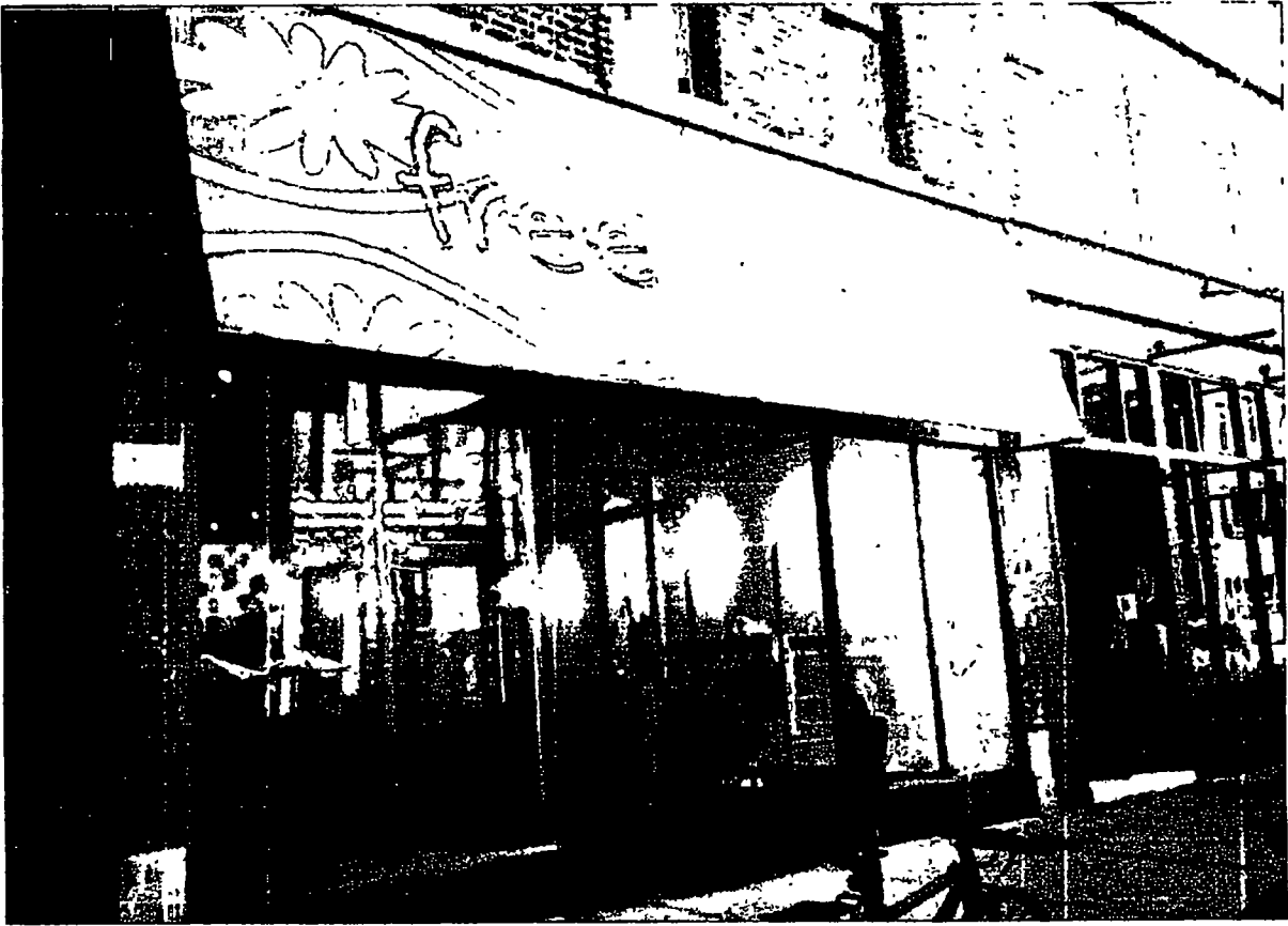
NEW SIGN - 1464 N. MILWAUKEE