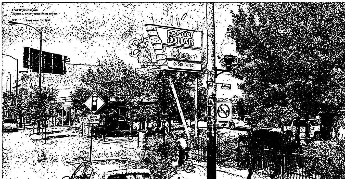
image capture Sep 2013 79 2014 Google

https://www.google.com/maps/@41.924297,-87.744956,3a,27.3y,301.16h,92.59t/data=!3m4!1e1!3m2!1sc5PhtraApWZ4ZFcsN... 6/24/2014