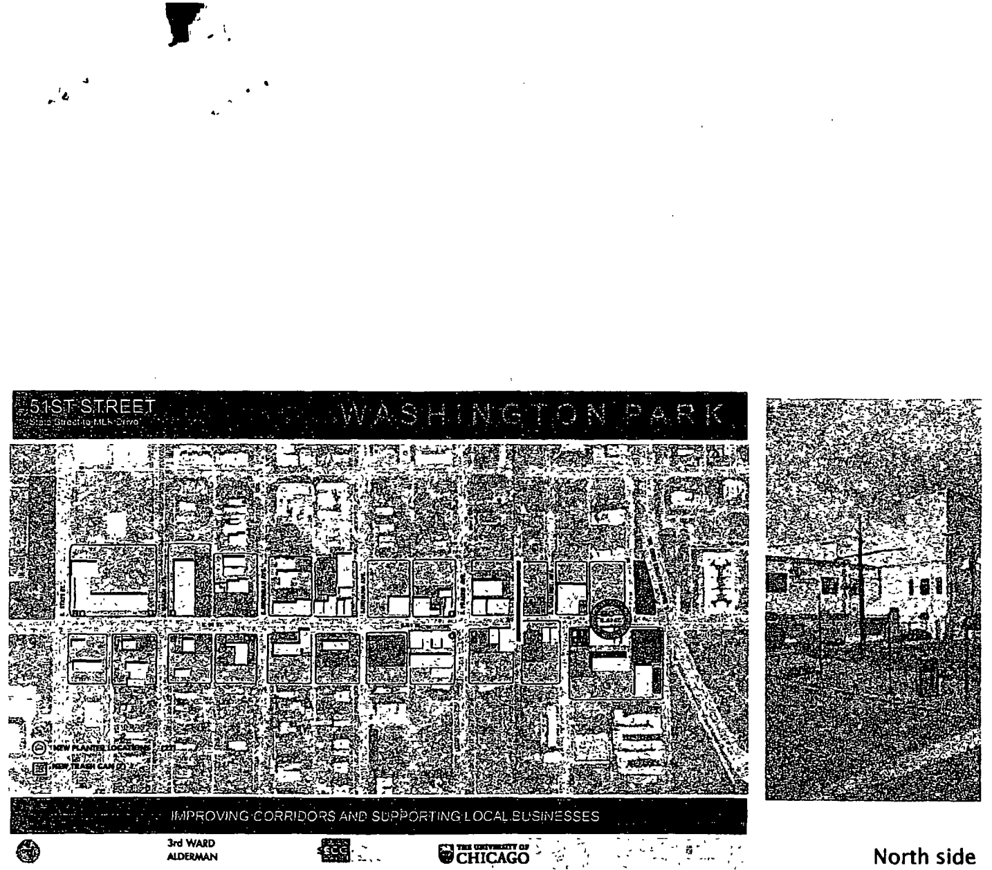
North side Jr. Drive. Tr