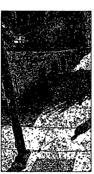
Southwest and 51st S