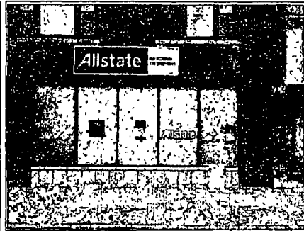
Existing Sign Dimensions:

Your approval of the Brandbook indicates your acceptance that the signage, provided to you and owned by Allstate, will be manufactured and installed as shown, pending landlord and/or municipality approval. Once accepted, signage may not be declined at time of installation for any reason other than a manufacturing defect.