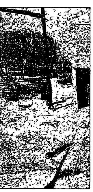
Northwe 51st Stre