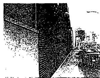
SIGN WALL LIGHT