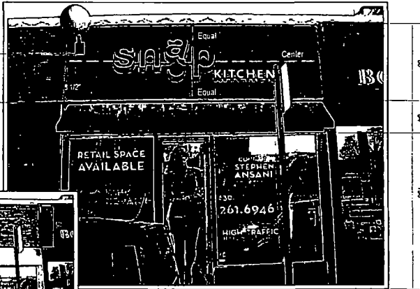
PROPOSED COMPOSITE (STOREFRONT) | 1/4" = 1'-0"