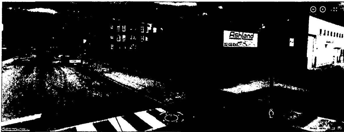
1545 W. Hastings St. proposed driveway location.