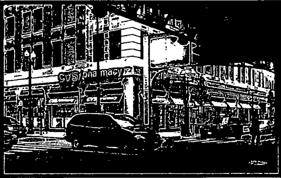
Existing Location Overview