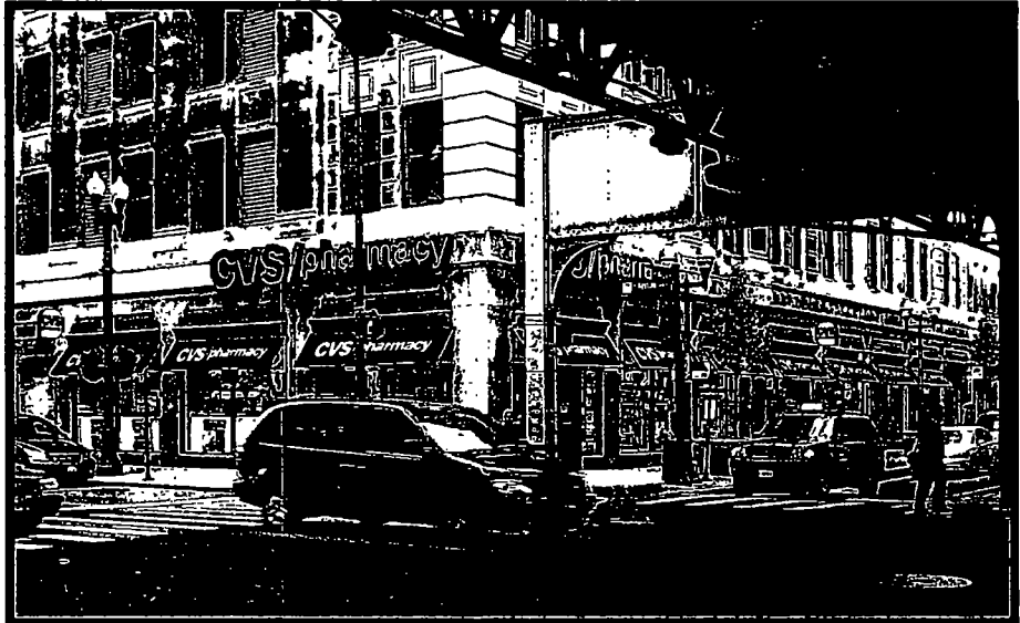
Proposed Signage Overview