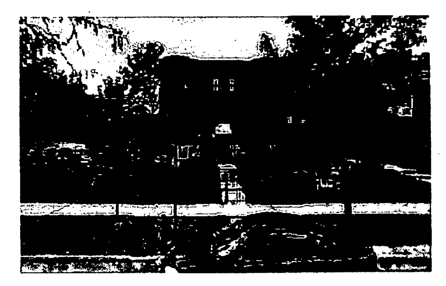
4700 N Beacon St Chicago, IL 60640