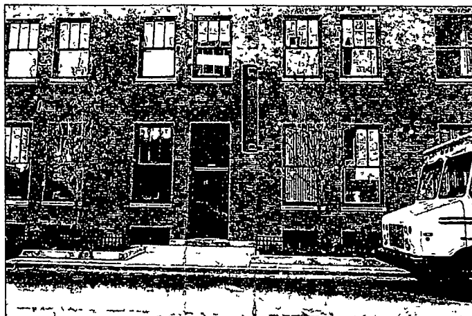
SHOWN ON BLDG.