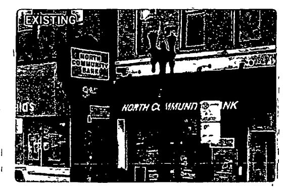
tenglet to bottom=15.10 ". Tenglet-to top= 19.0".

Chicago Dallas Tos Angeles New York // p 87/829 7196 // f 630 422 1699 // www.mleinc.com