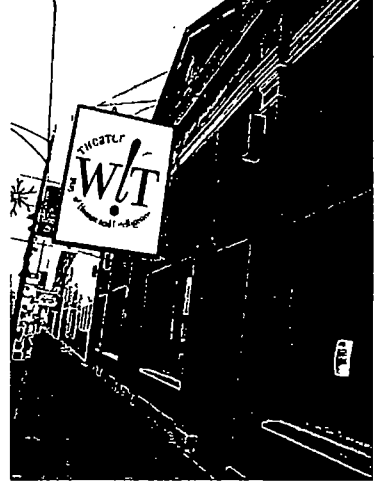
View On Belmont Looking East