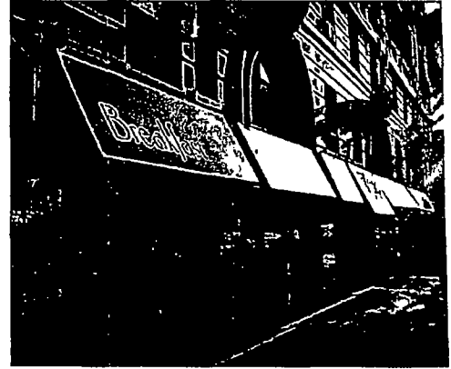
Diversey Pkwy Side