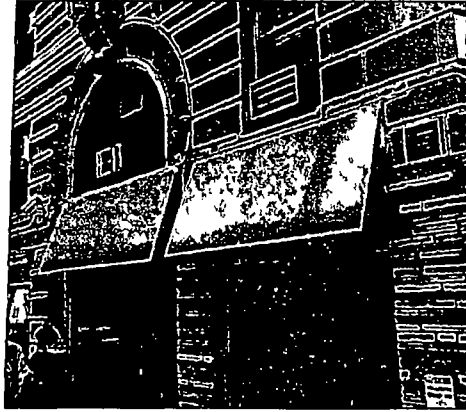
Pine Grove Av Side