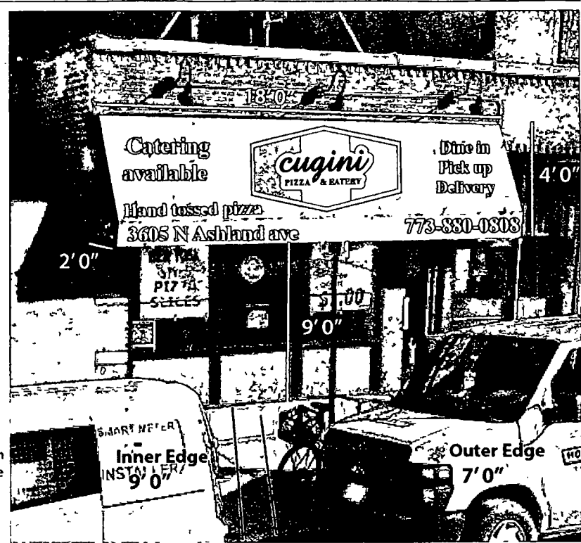
NOTE Photo for representational purposes only Signs are not to scale and may appear larger or smaller than shown

Sign Erector PRO IMAGE 2006 W. Chicago, Ave. Chicago, IL 60622 Tel. 773 292 1111 Fax. 773 292 1113