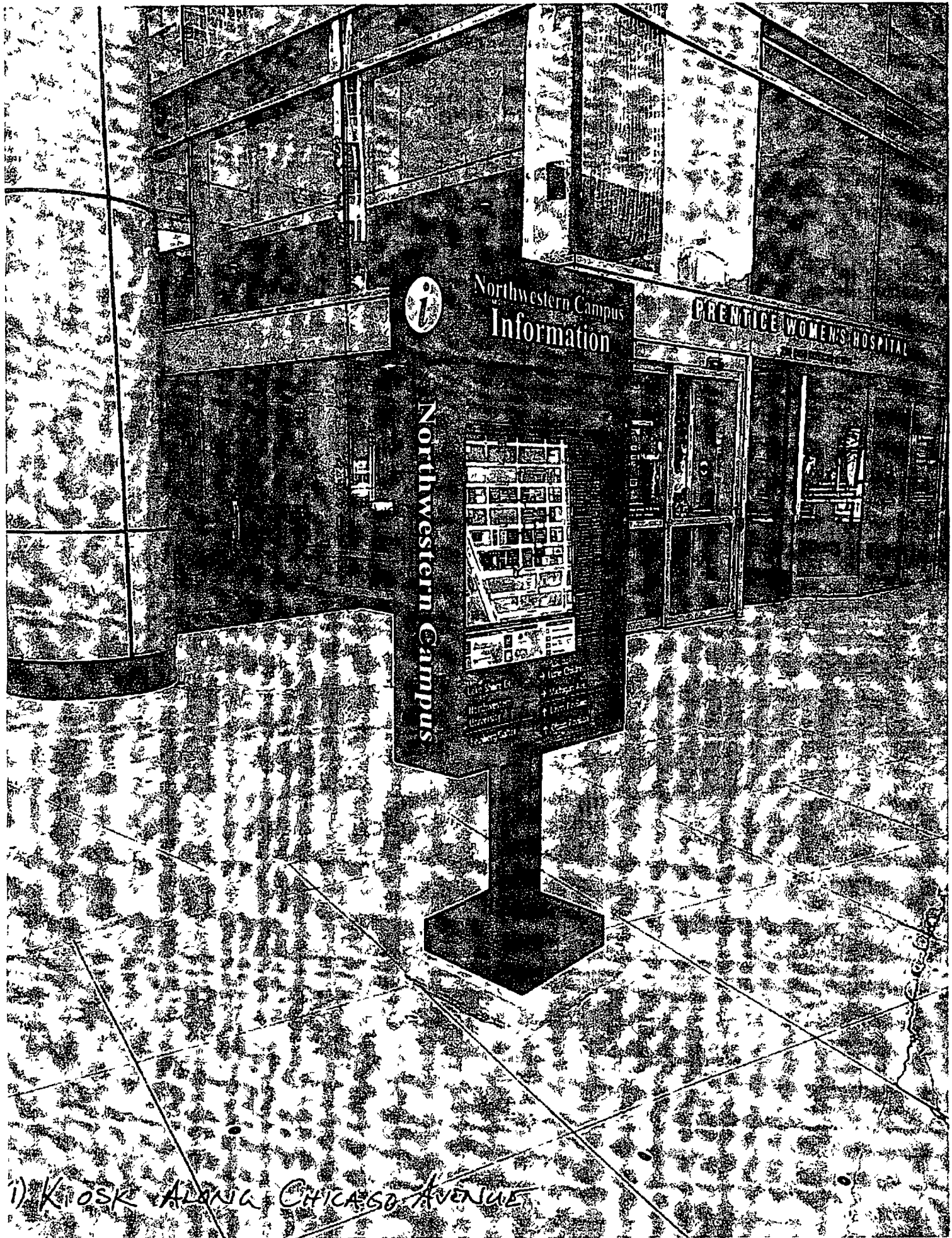
1) KIOSK ALONG CHICAGO AVENUE