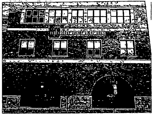
South Building Elevation (After)

South Building Elevation (Before) Existing Signage (1) Illuminated Letterset 105 Sq Ft