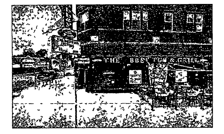
3420 W Grace St Chicago IL 60618