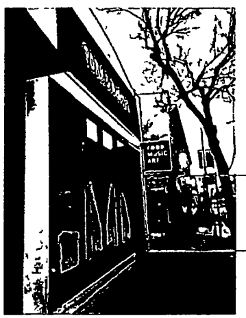
Southeast Elevation N.T.S.