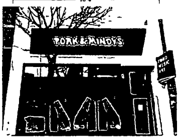
South Elevation N.T.S.