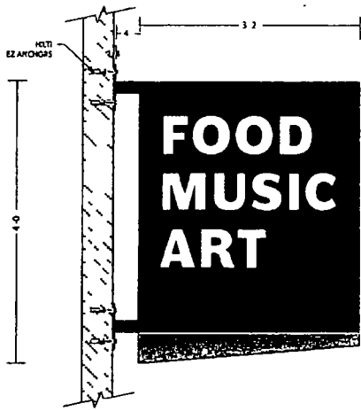
Front View 1 = 1-0