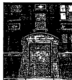
EAST ELEVATION - ENTRY STEP S RHODES AVE