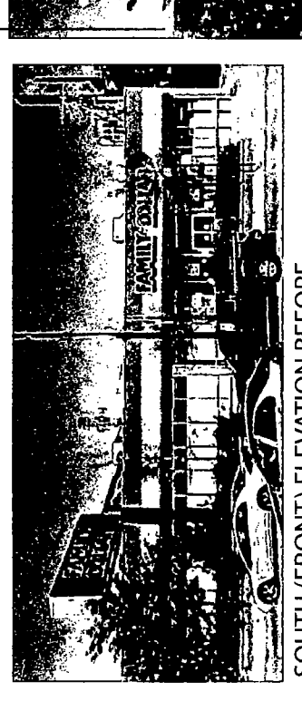
SOUTH (FRONT) ELEVATION BEFORE